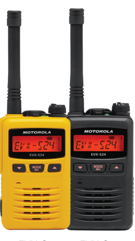
EVX-S24 EVX-S24 Yellow Black