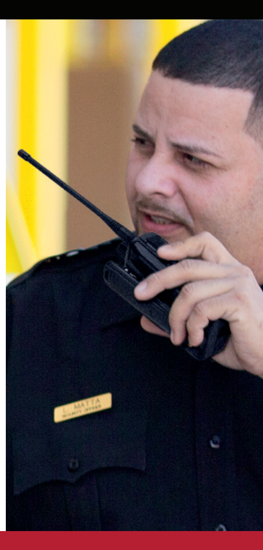
MOBILE ANALOGUE RADIOS